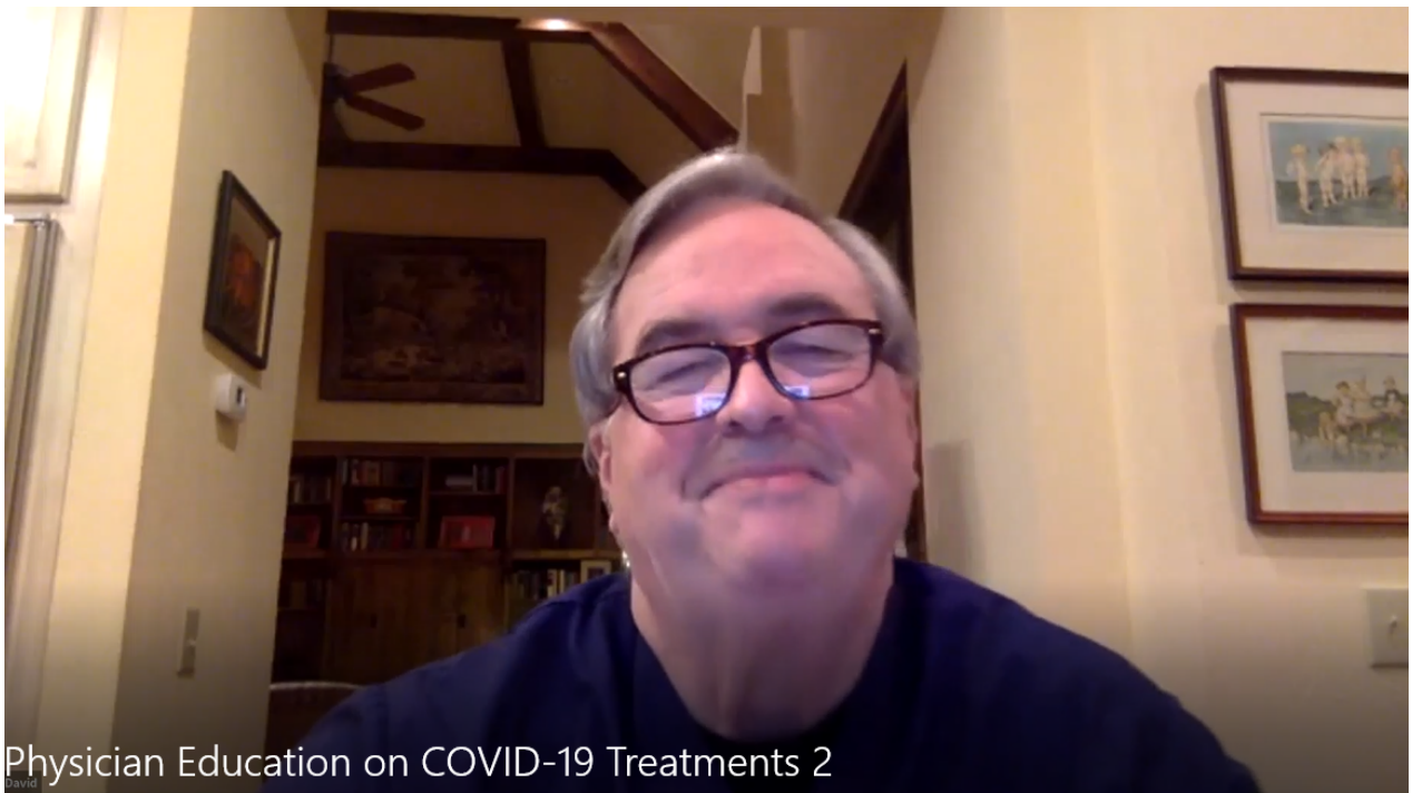
Physician Education on COVID-19 Treatments 2